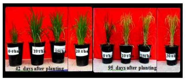
b. Saturation condition