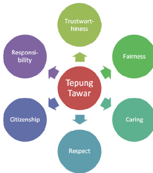
Figure 2. Six pillars of character scheme in “Tepung Tawar” traditions

Wisdom is contained in the symbolic gesture of “tepungtawar” tradition, which is characterized, perceived and interpreted by the wise and discerning people of Sumatra Selatan. This practice has created a peaceful life in the community. Character education values consist in the whole traditional process of ”tepungtawar” if affixed with the theoretical framework of the six pillars of character. The traditional practice of “tepungtawar”, analyzed comprehensively, contains the spirit of the six pillars of character as described in the following figure: