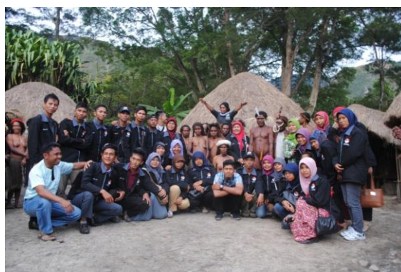
Document-1: Briefing on introduction of local culture to the participants of SM3T-UR by regency administration secretary, Lanny Jaya regency- Papua (18-9-2013) in Wamena.

In picture-1 above indicates that learners’ academic achievement at pre-test dated from 16-30 September 2013, of 450 learners, they were grouped from the first to the fourth grade, the incompetence in reading reached 38-40%, and writing incompetence from 40-50%, math incompetence about 55% and lack of knowledge about NKRI