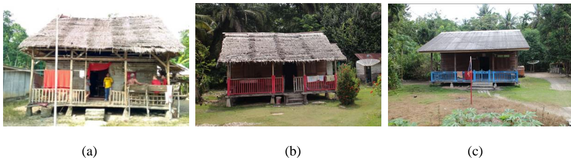
Figure 5. Rupert Akit house with leaves roof (a) wall board with leaves roof (b) wall board with zing (c)

Akit's house in Rupert islands (Figure 5) is built on piles. Interior of the house can be found in three main parts; umba as front space, main hall, and kitchen [3]. If we compare with Akit Meranti house form in Meranti (Figure 6), the same room division is amounted of three, but in has terms of slightly different naming. Selaso as umba-umba or front space, luang tengah as the living room, and luang dapu as kitchen.