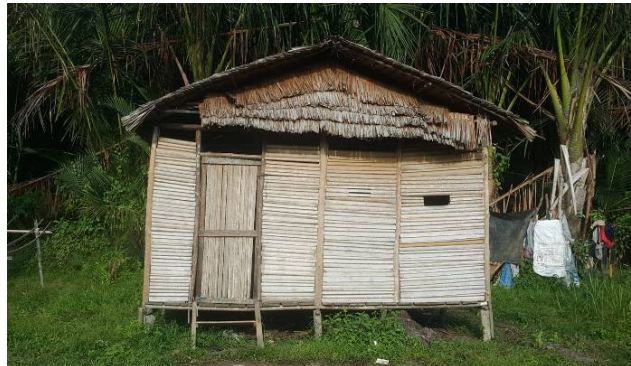
Figure 1. The native house of the wall midrib sago

The native house in Meranti islands is the stage house with wooden piles, roof made from the leaves, wall from the midrib sago, floor of wood or from midrib sago, and construction of the main wood with pegs (Figure 1). The existence of the house is assumed as the original and is difficult to prevail again. There are several houses in the village of Sesap that still have characterizes of the native tribes. The native house is consisting of living space, which serves as all space, the loose space not having the bulkhead. They limit itself in the house and is visible from grouping function, whereby on the front part for receiving guests, the middle part of the family room, and back part as the kitchen.