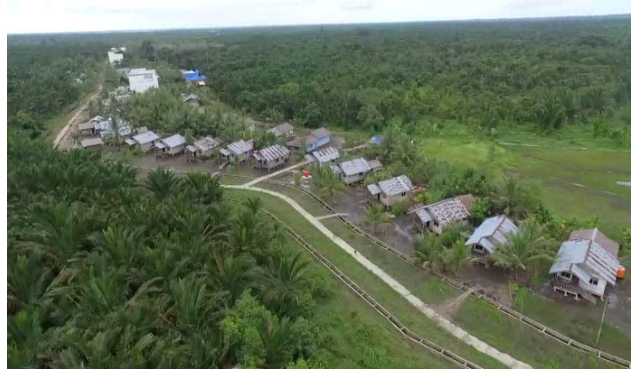
Figure 2. Tribesmen settlement with the sago plantation situation around