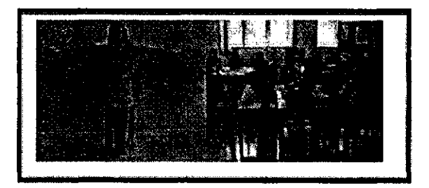
Figure 3. Video and Students

There are three strategies, the student just estimation, folding the figure and the student try measure the figure. Then, the students just watched the video, and then they decided where the line axis of symmetry locates. After that, they were shown dancing butterfly, they were expected to solve the problems: