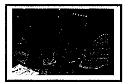
Figure 4: Results from Student

In second activity, students folded handkerchiefs that were distributed to each group. In this activity, we found that the students folded the handkerchiefs as following picture: