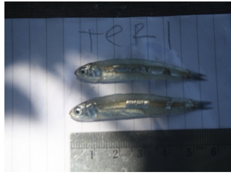
Anchovy ( Stolephorus sp )