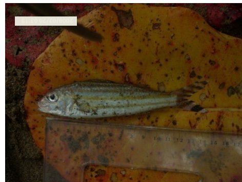
Goatfish ( parupeneus sp )