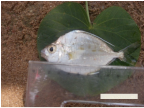
Dussumier's Pony Fish )