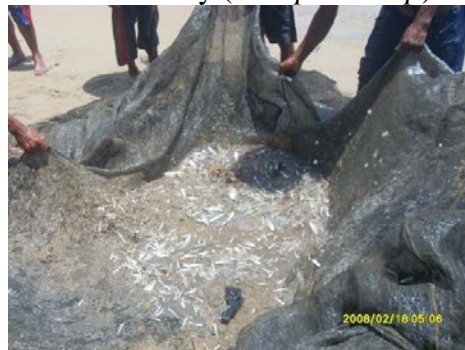
Catches of Beach Seine.