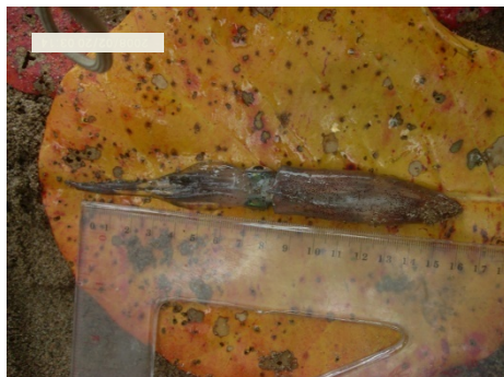
Squid ( Loligo sp )